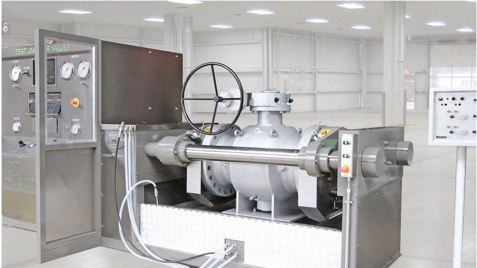
Computerized Valve Testing Machine

“ There are no secrets to success. It is the result of preparation, hard work, and learning from failure. ”