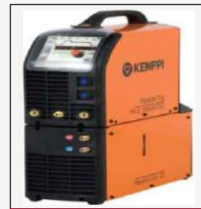
Mastertig MLS 3000

Apart from above, we offer inspection, testing and certification of valves as per industry standards (API 598, ANSI FCI70-2, ISA 75.19 etc)