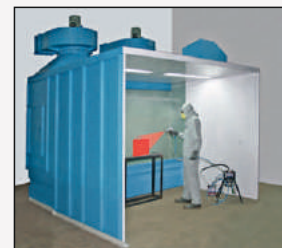
Over - Reel Paint Booth